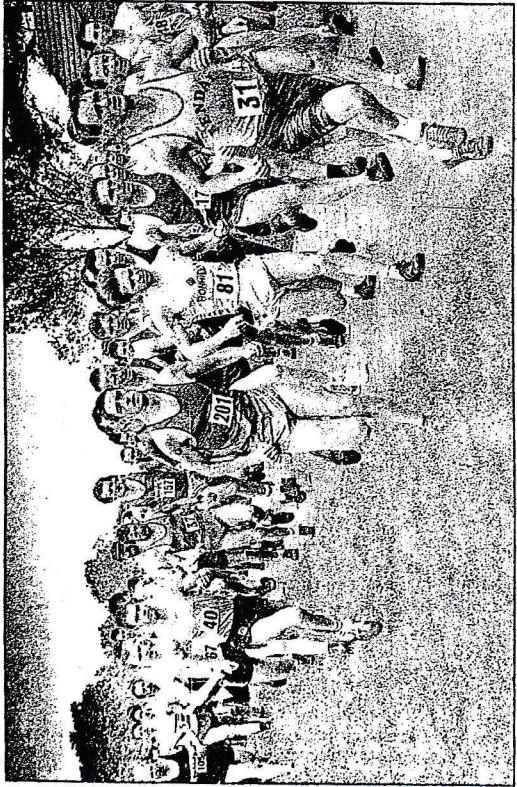
Fell runners set off on the 7 mile/1300foot Hutton Roof Crag Race. -AB21/196-2.